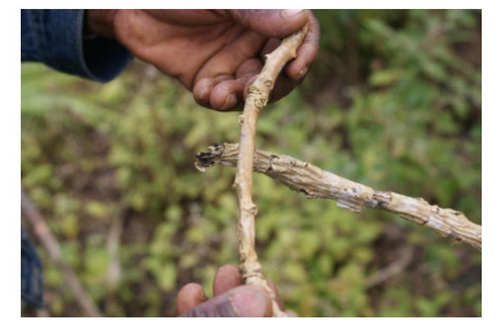
Photo 1. Mostly dead jatropha plants in the communal jatropha trial in Nhambita community. Photo taken by M. Schut in July 2009.

Following the government's promotion of jatropha, a communal jatropha trial in Nhambita community was established by the end of 2005. Between February and April 2006, the trial increased to around 4 ha. The jatropha grew extremely well during the first growing season, and, between May and July 2006, 250 farmers