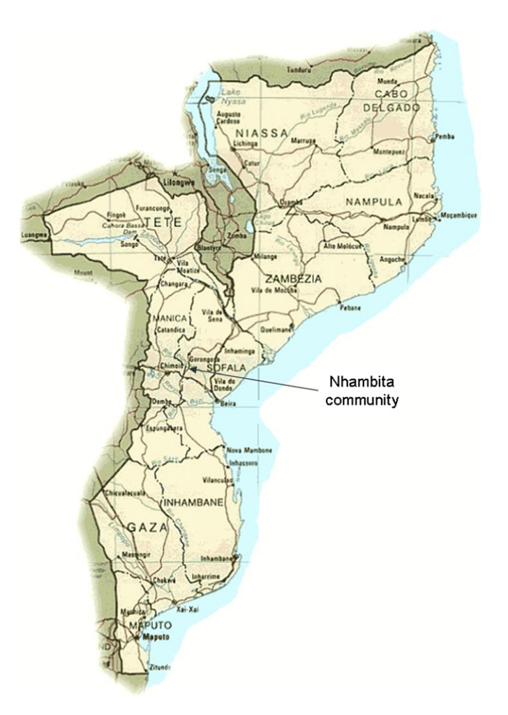
Fig. 2. Nhambita community in Gorongosa District, Sofala Province, Mozambique.

press was provided by the Ministry of Energy, creating a unique enabling environment for community-based biofuel production and use. Nhambita community is part of the Chicare Regulado (traditional authority) and accommodates around 85 households.